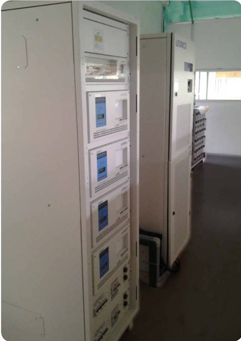
30KW solar power plant at MACFAST, Tiruvalla (A typical inverter, charge controllers and Monitoring units plant room at Macfast)