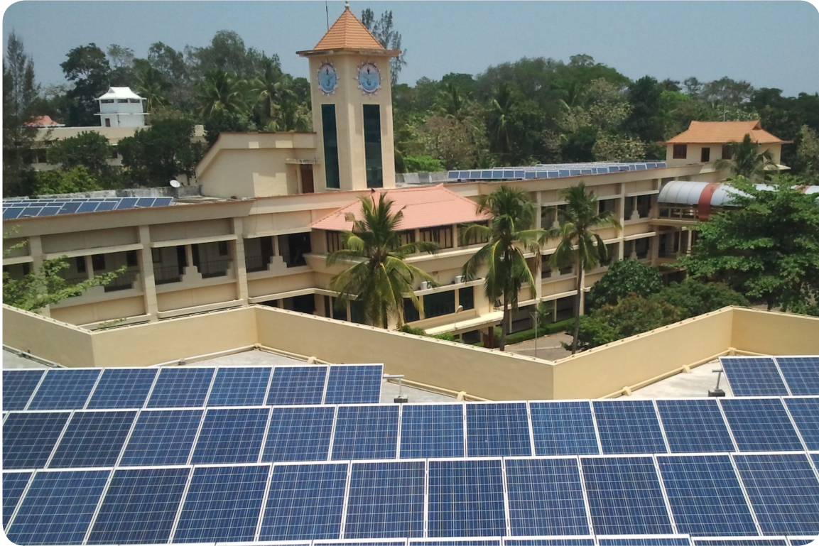
100KW SOLAR POWER PLANT AT MAR BASELIOS COLLEGE OF ENGINEERING, Thiruvananthapuram (A typical solar panel installation on flat roof in 3 different locations)