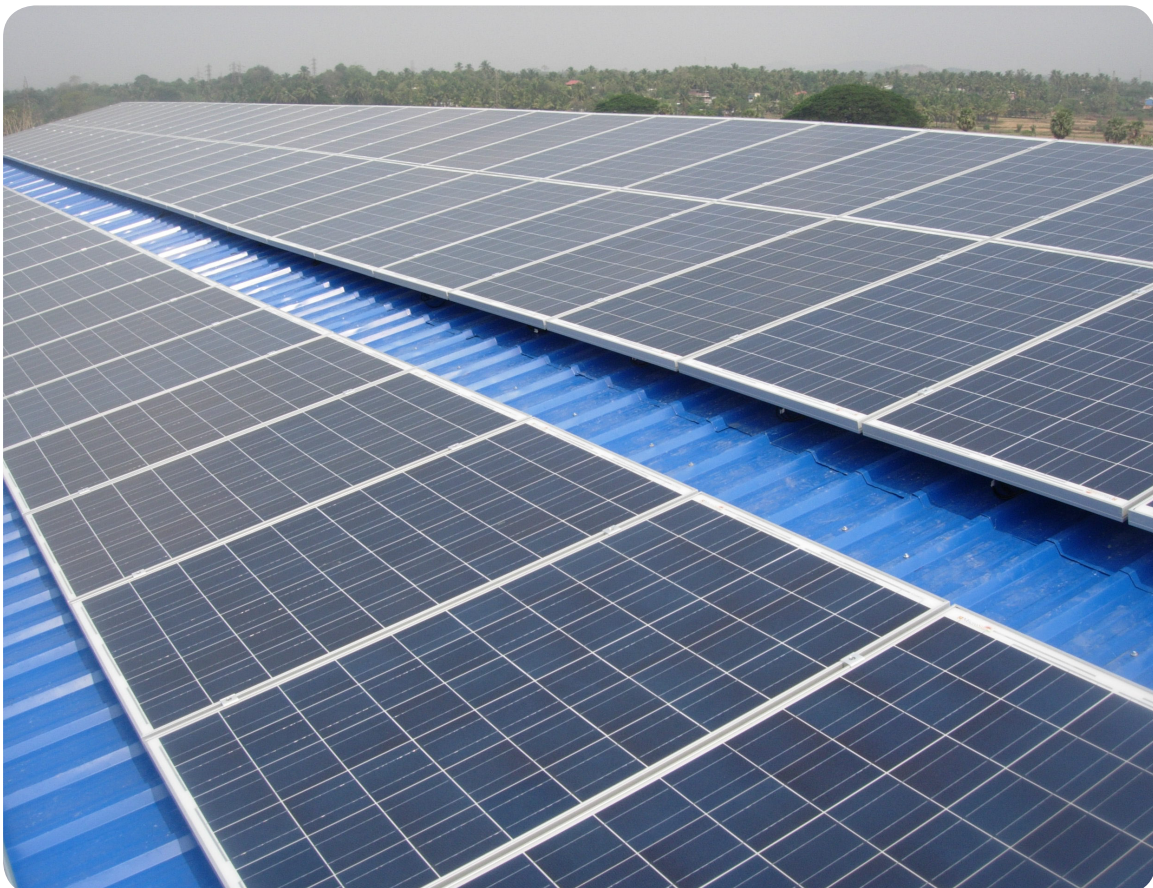
30KW solar power plant at Thangam Hospital, Palakkad (A typical installation of solar panels on sloping roof)