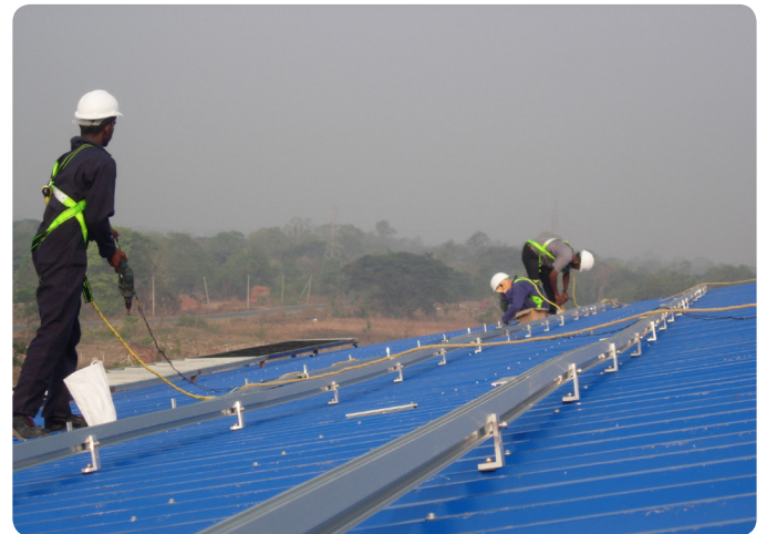
Our Installation crew at Thangam Hospital, Palakkad (A proof of safe installation by licenced electrical engineers)