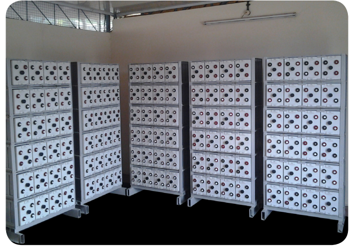
100KW solar power plant installed at Pushpagiri Medical College and Hospital, Tiruvalla (A typical Battery plant room at Pushpagiri College)